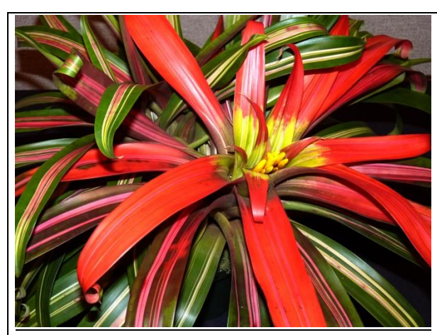
Variegated Guzmania sanguinea

Like most bromeliads, Guzmanias can be very forgiving when grown in less than ideal conditions as long as they are not exposed to too much bright light. If you have a shady place in your landscape, this would be the spot for your Guzmanias. Recognize also that most Guzmanias will not tolerate very cold temperatures, so when the weather forecast is for temperatures to plummet – it's time to bring those Guzmanias inside until danger of frost or freezing temperatures is past!