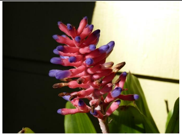
Another in the Ortgiesia group - Aechmea gracilis