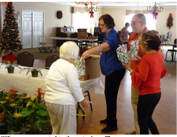
Gifts were presented to the outgoing officers