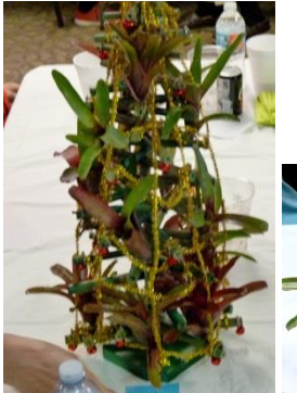
Bradley's Christmas Neo. tree