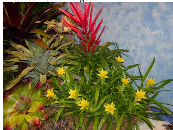
Guzmania Puna Gold used in a display. Instead, they may be identified in stores as simply "white bromeliad", "purple bromeliad", or even just "colorful bromeliad". That's a shame too, since many Guzmania species are quite beautiful in their own right.

This Genus has been hybridized extensively through the years and in many cases, names have been lost or forgotten.