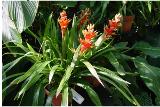
Guzmania donnel-smithii at Selby Gardens