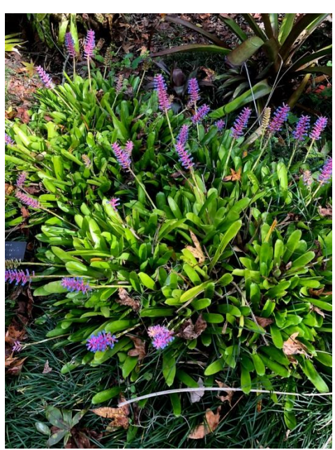
Aechmea gamosepala in the landscape in Port Orange.