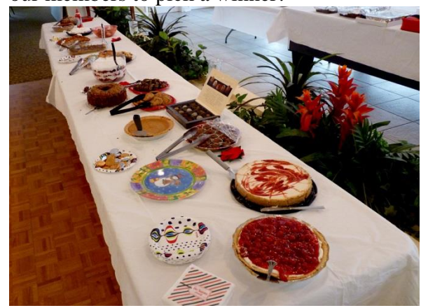
The dessert table – shortly before the "stampede"!

in the "members' choice "centerpiece contest – I don't think we've ever had a tie before in this competition and, in fact – all of the centerpieces looked great. It was difficult for our members to pick a winner!