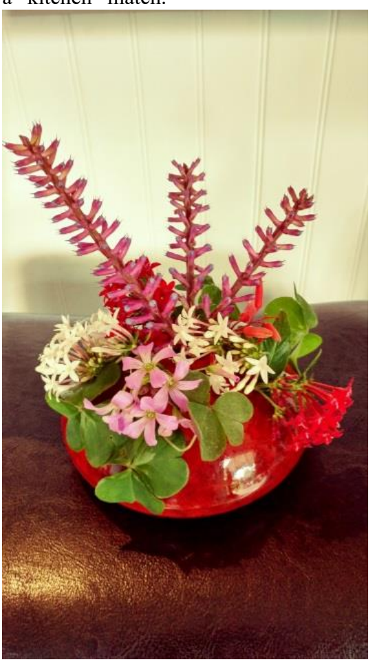
Aechmea gamosepala blooms provide height in addition to longlasting color in this beautiful holiday arrangement created by Jane Villa-lobos.

group of small to medium sized bromeliads in the Aechmea Genus. You can read more about them by going to the FCBS website and looking up "Aechmea gamosepala" under the photo index – check it out! For now, let's just say that a feature shared by plants in this group is that they are native to SE Brazil – and we have heard it mentioned many times that bromeliads from this area tend to adapt quite well to growing conditions in east central Florida! This also means that this group of plants tends to tolerate those brief drops in temperature into the 30s quite well that we often see at this time of year. One of the Ortgesia group most commonly seen in our area is Aechmea gamosepala – sometimes referred to as the "Ohio matchstick plant" due to its characteristic crossed light to dark purple flowers on a short inflorescence – resembling a "kitchen" match.