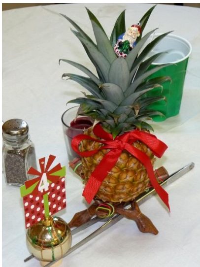
What's Christmas without pineapples? A display by Christophe Cardot