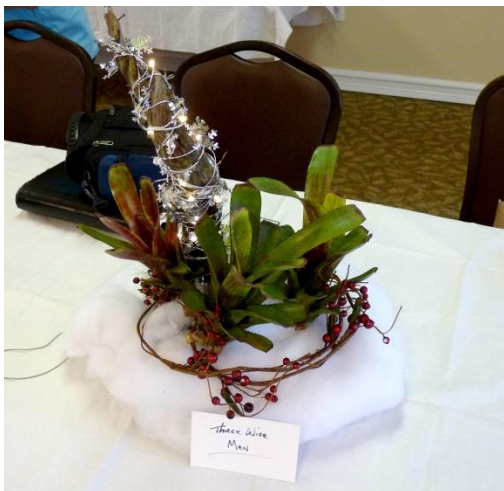
"Three Wise Men" – Aechmea nudicaulis mounted on driftwood.