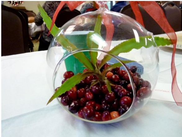
A red and green display using Cryptanthus 'Warren Loose' on a bed of ripe cranberries – by Calandra Thurrott