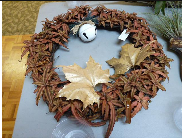
How many Cryptanthus plants does it take to make a wreath? See if you can count them all at January's FECBS meeting.