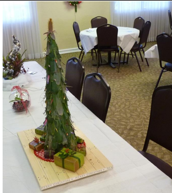
The winning entry in this year's centerpiece contest.